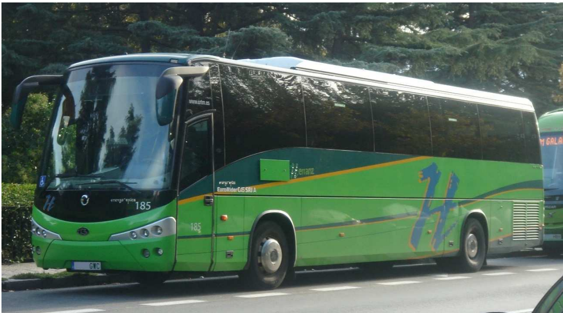
Figure 2: Herranz company Bus.

http://www.madrid.es/portales/munimadrid/es/Inicio/Movilidad-y-transportes/Direcciones-y-telefonos/Linea-664-interurbana-de-autobuses-Madrid-San-Lorenzo-de-El-Escorial-por-Guadarrama-?vgnextfmt=default&vgnextoid=e7e7b795eaa8b010VgnVCM2000000c205a0aRCRD&vgnextchannel=262f8fb9458fe410VgnVCM1000000b205a0aRCRD